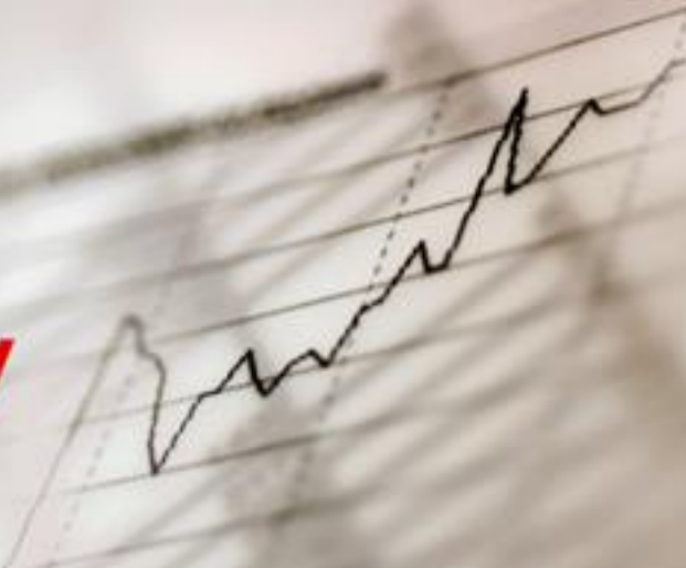
Chart of the Day

The S&P 500 has had its worst start to the year in over 80 years, down (-13.3%) at the end of April, and (-16% ) YTD, as investors are increasingly worried about rising inflation, Fed tightening, China lockdown and the Ukraine crisis