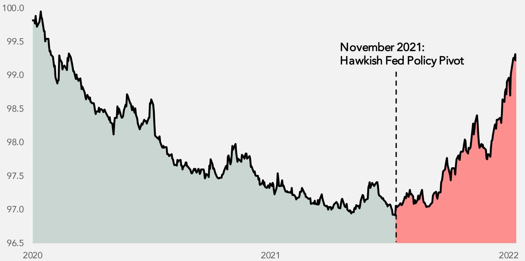
Tightening of US Financial Conditions (YTD performance in stocks, bonds and currencies)