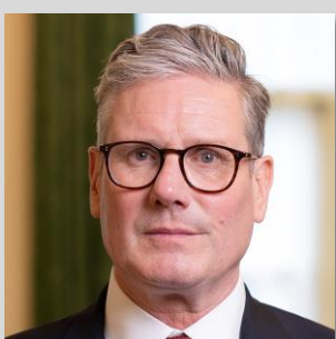
Prime Minister Keir Starmer