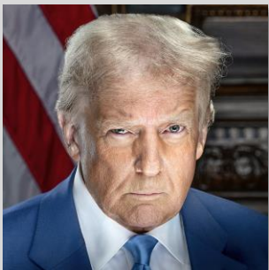
President Donald J. Trump