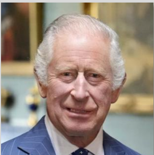
King Charles III